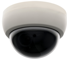
Side – view