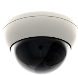
• Side View